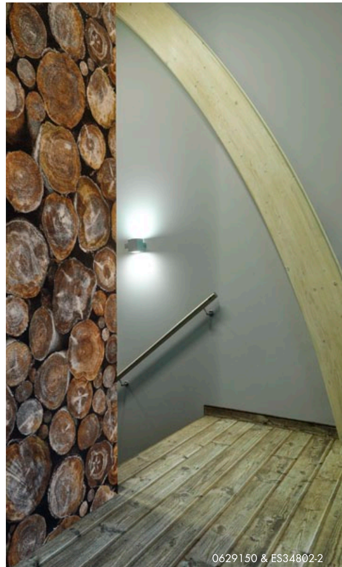
0629150 & ES34802-2