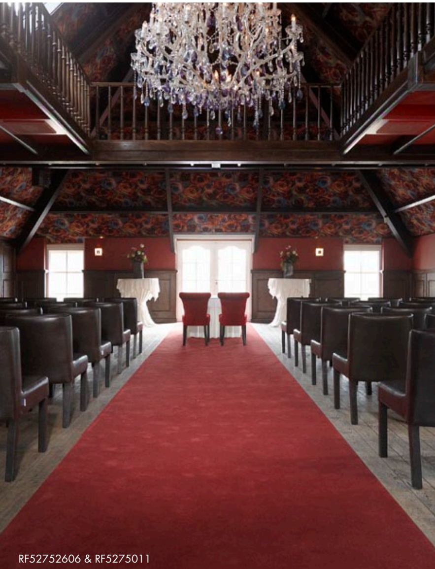
RF52752606 & RF5275011